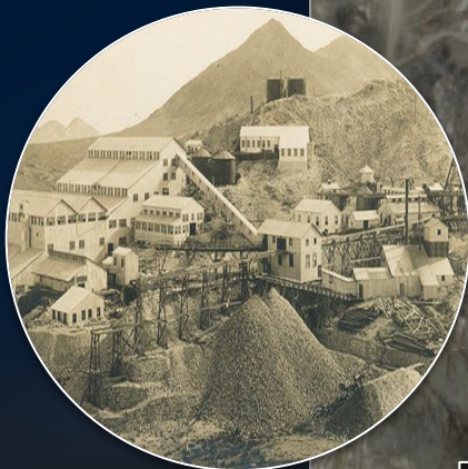
Belmont Mine and Mill, 1913